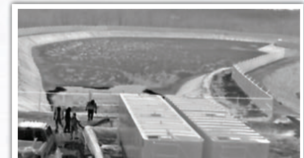
HD Camera image during the day (left) Thermal Camera image at night (right)