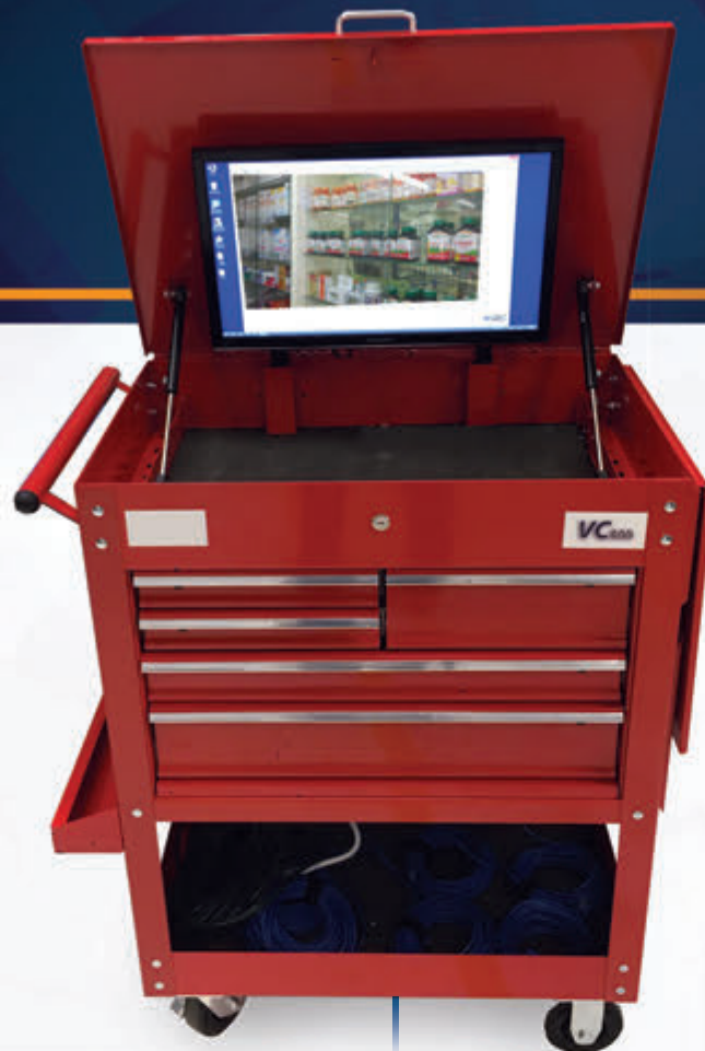
VC400 Mobile Surveillance Cart for temporary surveillance