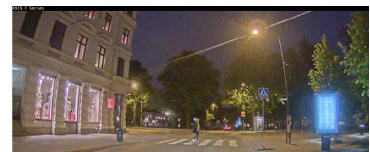
Wide Dynamic Range allows for the capture of footage in poor lighting conditions