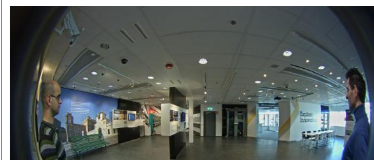
The 194° field of view provides a wide angle of coverage perfect for indoor and outdoor surveillance

i2c Technologies is an AXIS Communications Solution Gold Partner based in North Canton, Ohio. We are a leading supplier of deployable video surveillance units for law enforcement, utilities, and government with hundreds of units in use throughout the U.S. Request a quote online at i2ctech.com or by phone at 888-422-7749.