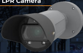
Axis LPR Camera