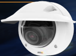
Axis Fixed Camera

Sturdy, high performance cameras with built-in analytics that capture license plate data in real-time and can compare or add a vehicle to a pre-defined database or watch list. When a vehicle on a watch list passes by, the LPR cameras will take appropriate action such as generating alerts and tagging video of the vehicle captured on other cameras on the network.